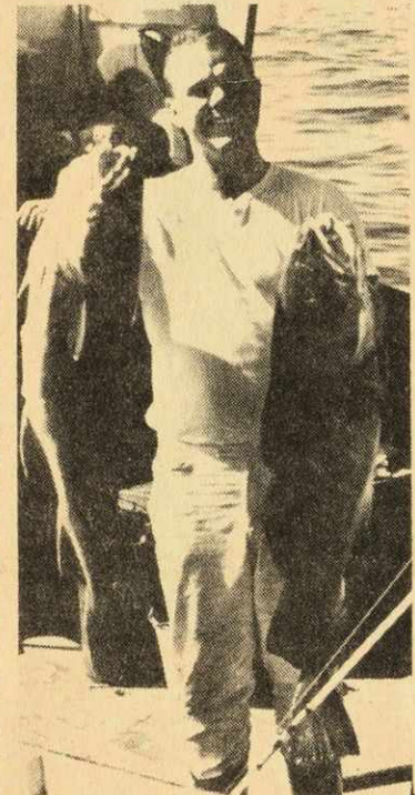
PROUD CHAMPION from the University of Western Ontario exhibits trophy during World student fishing meet.

Final standing were: St. F.X. competition organizers since the 981; Yale, 514; Japan, 363; Harseminar is considered to be a tuna vard, 221; University of Toronto, fish competition and none were 182; University of Western Ontario, 159; University of Mass. Dalhousie entered a team which 130; Princeton, 97; Dalhousie, placed ninth over the three day 62; Dartmouth, 38 and University