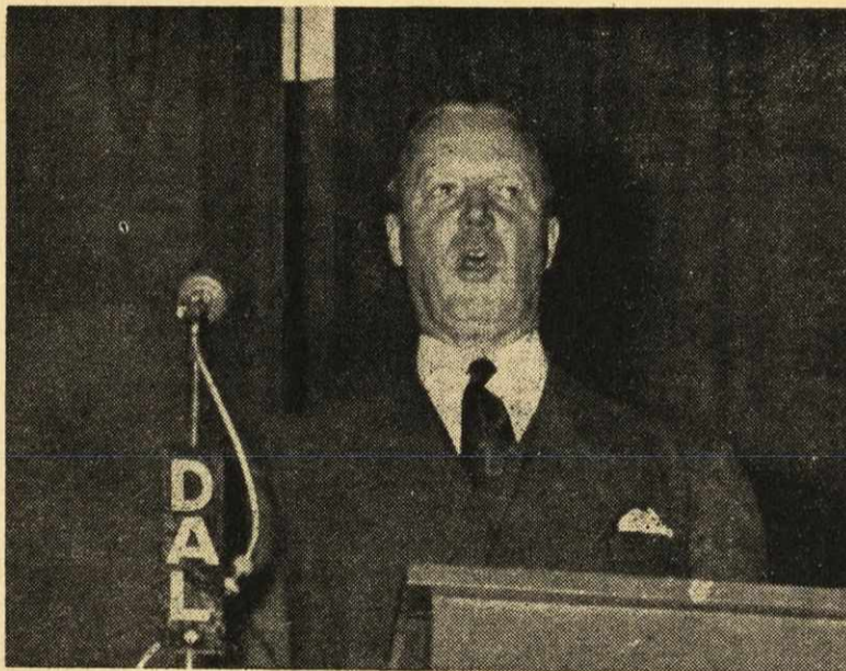
. . . FIRST, LAST AND ALL TIME