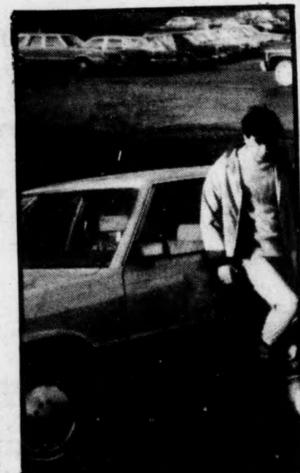
Beastie, the unknown hitchhiker and the Bruns car, Bonzo.

4. That CFS Services be instructed to collect such information as is necessary to prepare an instructive guide to real estate (student housing) investments for use by all interested student organizations,