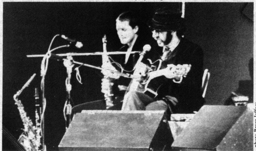
Leon Redbone (right) and his band were compelled to give a second encore after a captivating show.

Overall, this album is a must for everyone, faithful Chris de Burgh fan or not. It is one of the best buys of the fall.