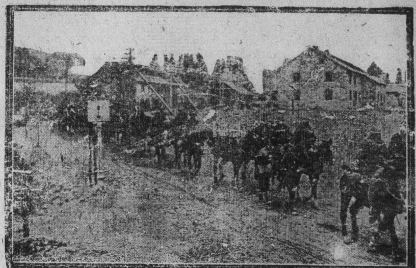
BRITISH CAVALRY CROSSING THE GERMAN BORDER.—This historic photograph was taken in a little Belgian village on the frontier. The sign post in the foreground marks the actual boundary line.