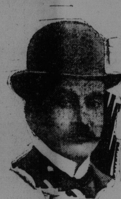
DUKE OF BROGANZA.