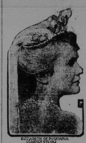
(By Queen Elizabeth of Roumania.)

From "The Golden Thoughts of Carmen Sylva" published and copyrighted by John Lane Co.