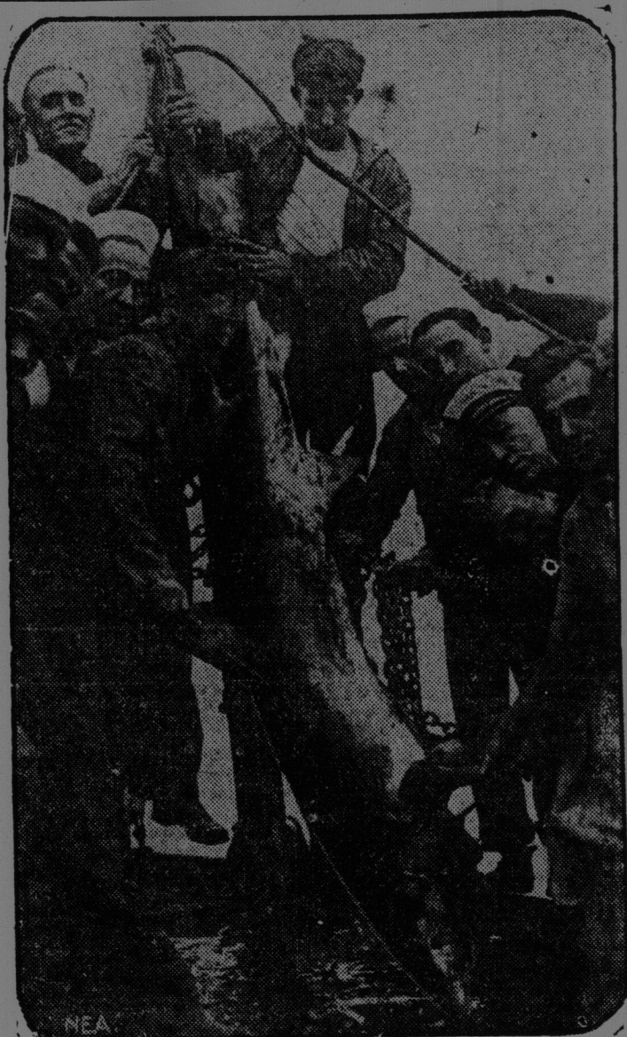
Deep sea divers engaged in salvaging the wreck and recovering bodies from the sunken submarine S-51, off Block Island, R. I., now have a new peril—sharks—added to their difficult work. This shows a big shovel-nose shark that had just been hooked aboard the U. S. S. Camden.