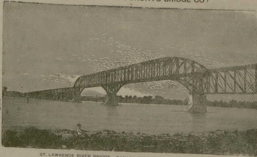
ST. LAWRENCE RIVER BRIDGE, CANADA PACIFIC RAILWAY, LACHINE, P. Q.

For Railways and Highways, Iron Bridges, Turntables, Iron Piers and Trestles, Bridge Rods, Right and Left Hand Sleeve Nuts and all kinds of Structural Iron Work.