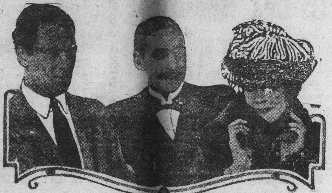
Thomas Meighan, Maym Kelso and Bertram John in William DeMille's Production "Conrad in Quest of His Youth" A Paramount Picture

If You Believe There's Nothing More in Life Now That You're Growing Old, You Should See this Photoplay.