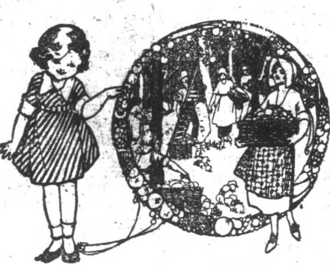
Little Miss Sunrise shows you the Orchard.

The Story of SUNRISE Preserves Number 1.