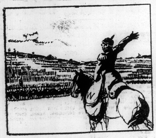
THE WAR LORD. Kaiser (before Verdun)-"And when you are all dead we shall have advanced 200 yards .- La Victoire, Paris.

Small Guardship Blown Up By Mine off Falsterbo. Stockholm, via London, June 21small German guardship has been blown up by a finine off Falsterbo. All except one of the crew were seen ed and brought to Sweden.