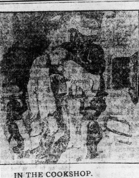
The Master Baker (to illustrious amateur)-I'm afraid sir, your cakes dough." -The Bulletin (Sydney).