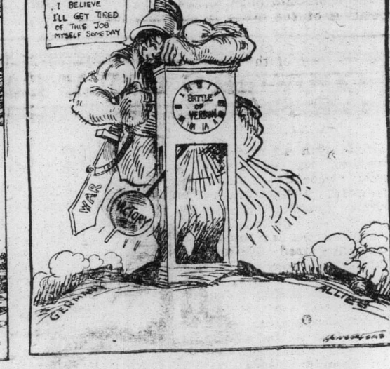
WINDING IT UP FOR ANOTHER DAY -The Pittsburgh Sun.

Philip Gibbs Writes of dian Stand a Ypres.