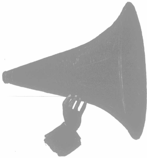
No. 41, Oak, price, $12.00. No. 42, Mahogany, price, $15.00.

Although wood horns have been made and used for a number of years, we have never placed one on sale until recently, because we were unable to find a horn that would meet all our exacting requirements, both as to appearance, acoustic qualities and durable construction. Our horns are made of seasoned three-ply veneer, oak or mahogany, cross-banded and so constructed that they will absolutely not warp or lose their shape. Both the outside and inside layer of veneer are arranged so that the grain runs spirally. There is only one joint on the side, a patented wood rim, which holds the bell in perfect shape. This horn embodies all the good points of other horns, with many improvements. By its use the annoying "dominant note," so evident in some horns, is permanently eliminated. The Columbia Wooden Horn, like all other Columbia Horns used in connection with the aluminum tone-arm, screws solidly into the elbow, so that it cannot fall out, and is readily interchangeable, fitting any disc graphophone and any of the tone-arm cylinder graphophones.