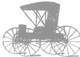
No. 10 Piano Box Buggy. Price $57.00.