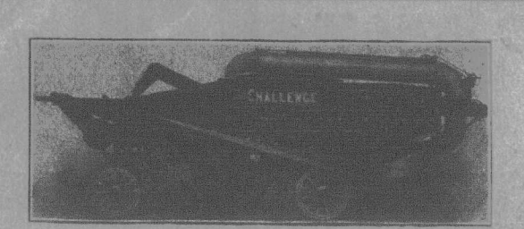
The White Challenge with Wind Stacker.

HAS THIS ENGINE 903 DONE ANY WORK FOR YOU?