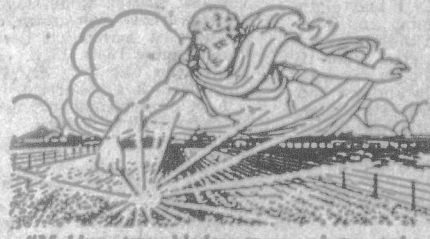
"Making two blades grow where only one grew before"

Representatives Wanted in Unallotted Territory