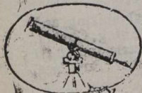
Registered Trade Mark.

Locks in all qualities for Cabinet Makers, Sash Fasteners, Locks & Brassfoundry for Builders' Ironmonger. ALL KINDS OF KEYS MADE on the PREMISES.