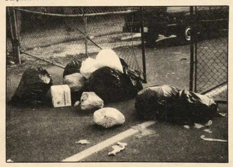
Garbage carriers strike causes pile-up outside trash station gates.