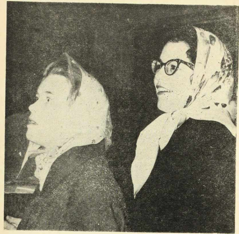
That a variety of exam results were perhaps the most outsanding of this term is evident from the responses of the two students pictured above on the day that most of us would like to forget. Although final figures on the averages acquired on campus are not yet available from the Scholarship committee, the Gazette will publish them in the near

An excellent turnout marked the success of the Freshman