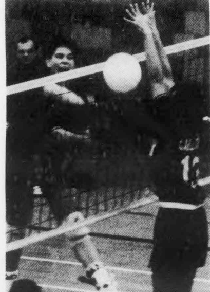
Reds in action at Tourney

The Reds started the season showing why they were the AUAA champions last year.