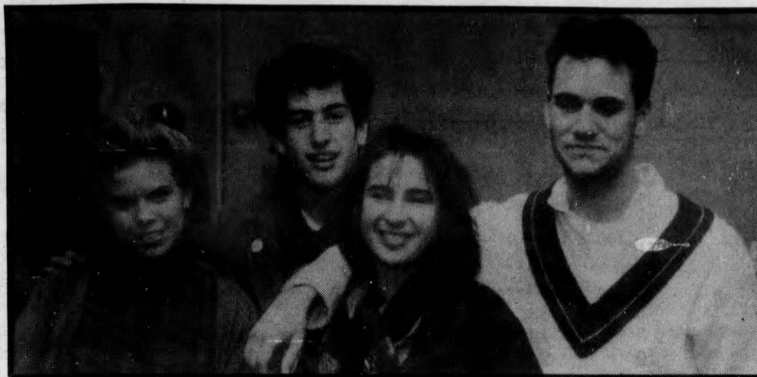
The four young members of SAGE after a speaking engagement in Fredericton.