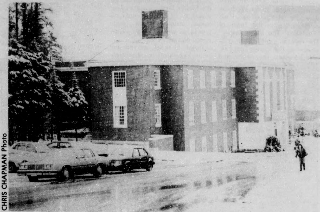
Ludlow Hall as it looks at present. It will be expanded in order to increase the law library's capacity.

Other facilities will be a part with this project, such as study carrels, working areas, 5 pand the library's capacity to facilities for computer ter- o minals, microfilm readers, The deadline for tenders is storage areas, a new circula-December 2 when a general tion desk, a student locker contractor will be chosen. It is area, office space and two