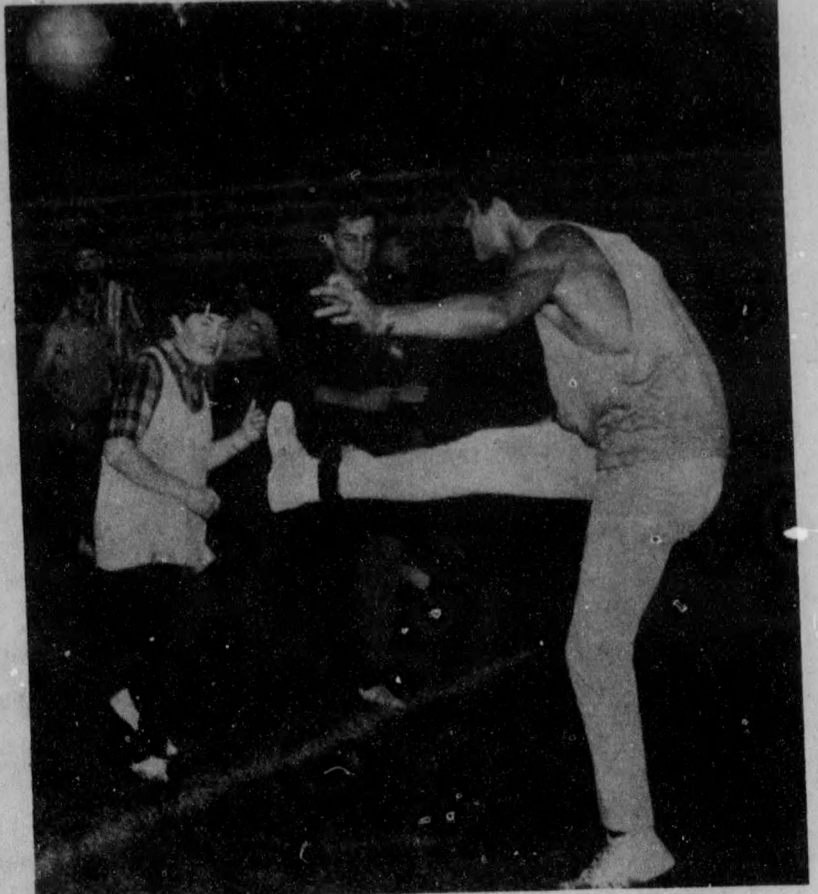
Equality for women - the annual sports night for freshmen featured a co-ed soccer game. What a way to get your kicks.

The other field secretary will work with all member institutes to create student housing co-operative across Canada.