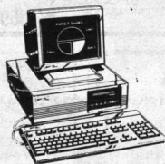
Z-286 AT-Compatible PC