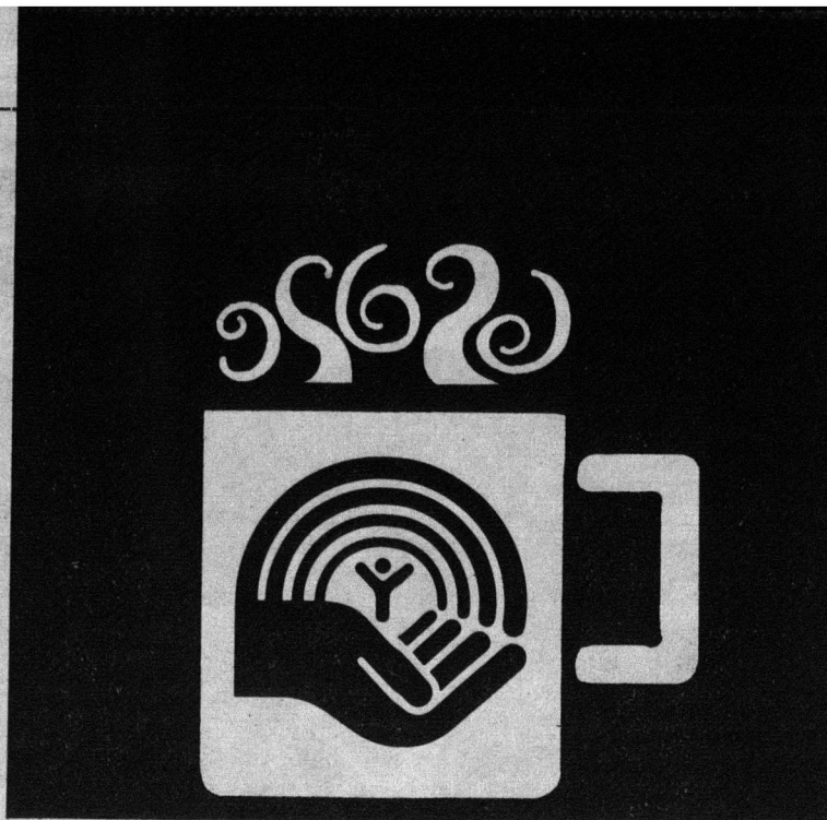
See the above logo? That's the button you want to buy for a buck if you want free coffee on Friday. Proceeds to the United Way.