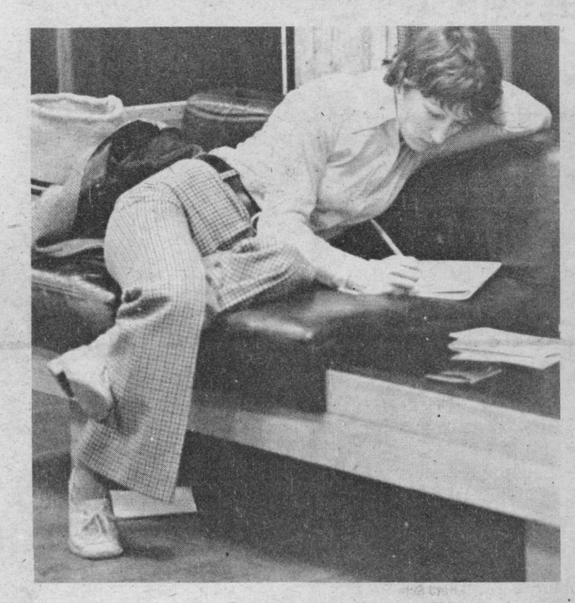
Let's see: for $100.00 I could go to Calgary for a week, or for $ 250.00 I could go skiing for a week, and for 600 big ones I could go to Hawaii for New Years', and for one plugged nickel, I could forget all these exams.

They served up a gournet's version of chicken in wine sauce