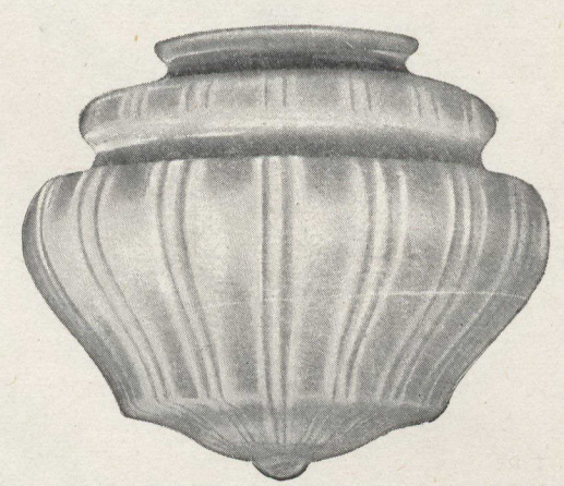
No. 9070. Grecian Lantern.

It is cheaper, too, than the old way, for less candlepower will produce more illumination, so great is the deflecting and diffusing effect of this chemically perfect glass.