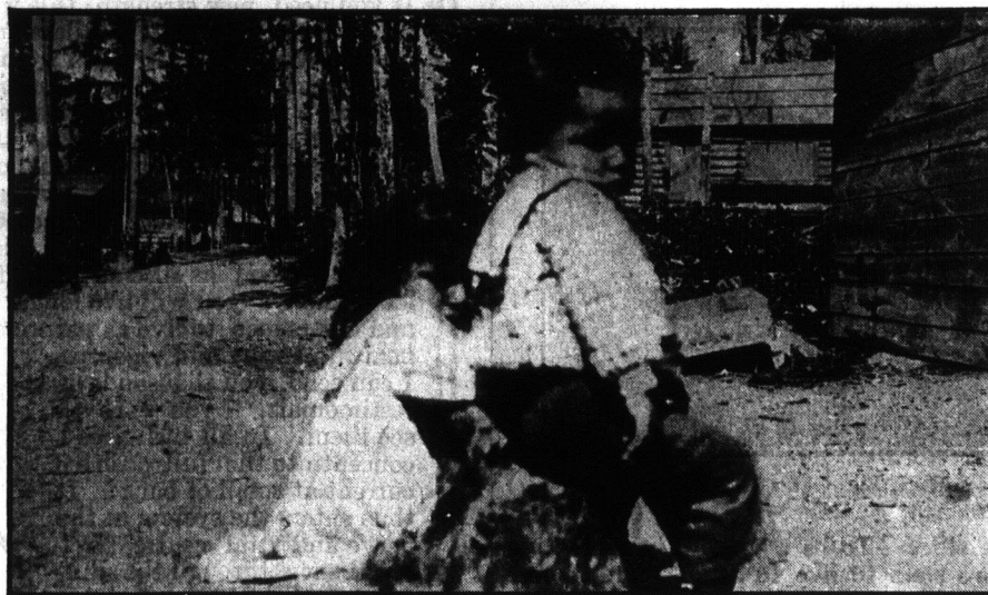
Lover's Resort, Point du Bois.

A physician took it into his head to go hunting, says the Boston Herald, and started out bright and early on a beautiful October morning, fully armed for game.