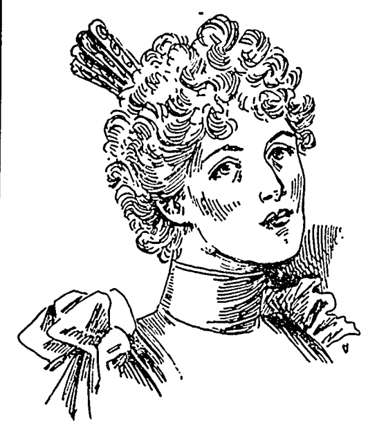
When She Was Dyspeptio.