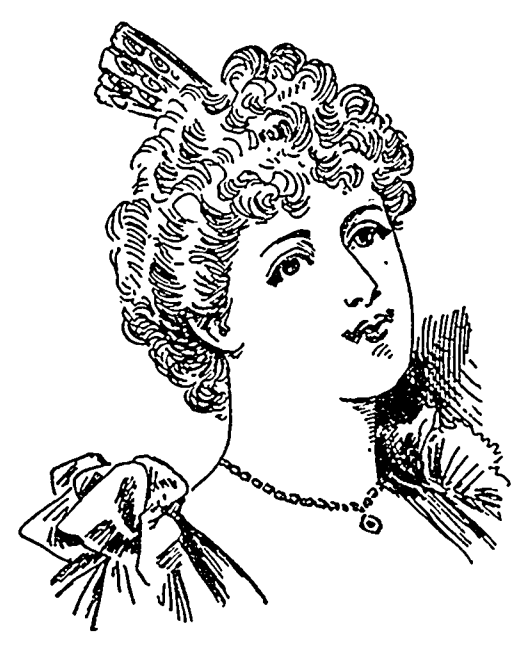
When She is Well.

poor and vitiated quality of blood in persons whose stomachs do not digest food properly-pale, pimpled, thin and sallow cheeks will come. Woman, in the desire to keep up her standard of good looks. may try to cover up the waste places with paints and powders, cosmetics, creams, but day by day she knows there is a wasting away, which, if not repaired will end seriously. As the mirror reflects the face, so does the face tell the story of stomach trouble. Dodd's Dyspepsia Tablets insure the perfect digestion of foods taken into the stomach, and correct stomach disorders, overcome constipation and send rich, pure and wholesome blood to the cheeks. Ladies find life more enjoyable in every way, and to many suppers, parties, etc., that have been prohibited are made possible. 50 cents per box; or, 6 boxes for $2.50, of Druggists, or by addressing