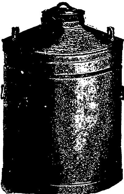
"EMPIRE STATE" MILK CAN.