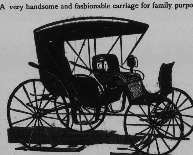
AN ELEGANT EXTENSION TOP BUGGY. Perhaps one of the most serviceable and comfortable carriages built. Commodious and handsome.