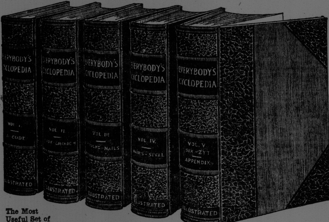
The Most Useful Set of Books on Earth

No other charge—just a coupon such as is printed on page 2, of this issue, and you get the complete five-volume set all at once.