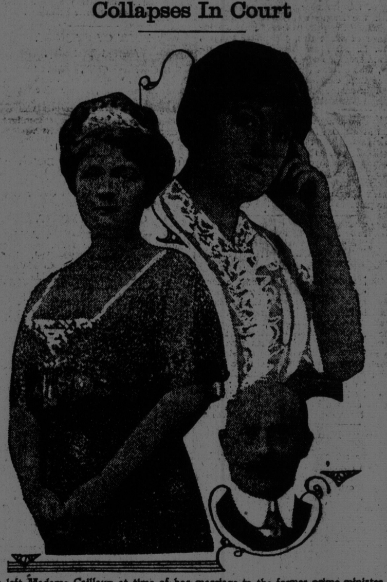
At left Madame Caillaux at time of her marriage to the former prime minister of France and, at right, as she is today. Below is Joseph Caillaux.

One of the Judges Challenges Another To Duel and Mme. Caillaux Collapses In Court