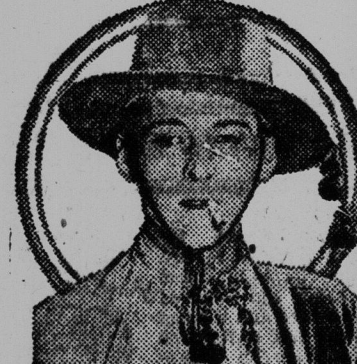
RUDOLPH VALENTINO as JULIO in THE FOUR HORSEMEN of the APOCALYPSE

REALISM A FEATURE OF "THE FOUR HORSEMEN"