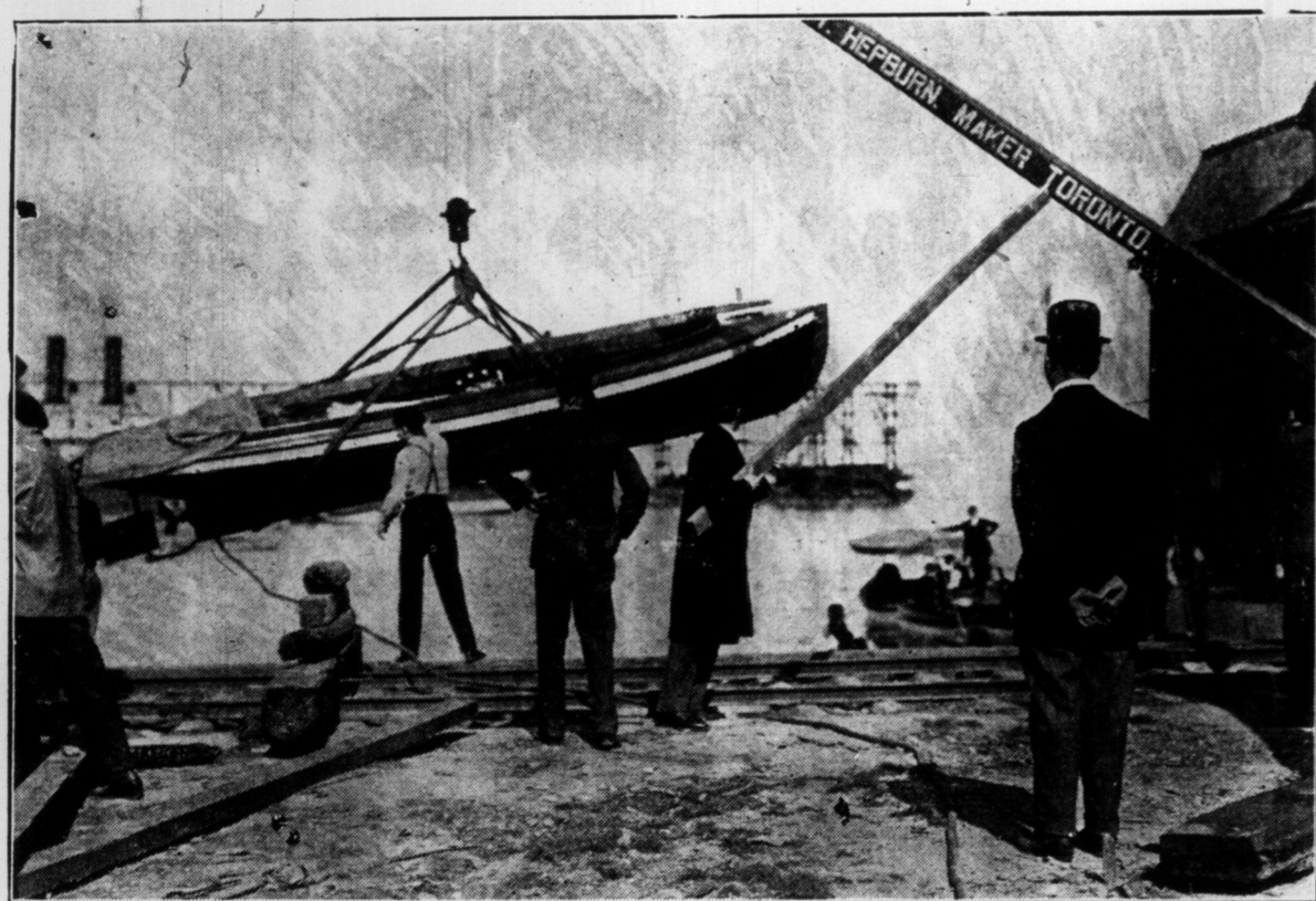
LAUNCHING MOTOR BOAT AT NATIONAL YACHT CLUB, FOOT OF BATHURST STREET.