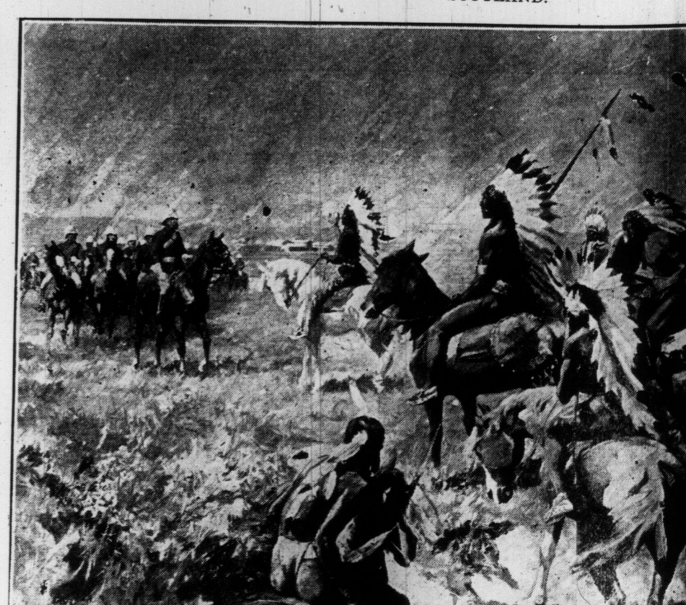
COL. MACLEOD AT THE HEADQUARTERS OF MOUNTED POLICE AT FORT MACLEOD, TREATING WITH THE INDIANS.