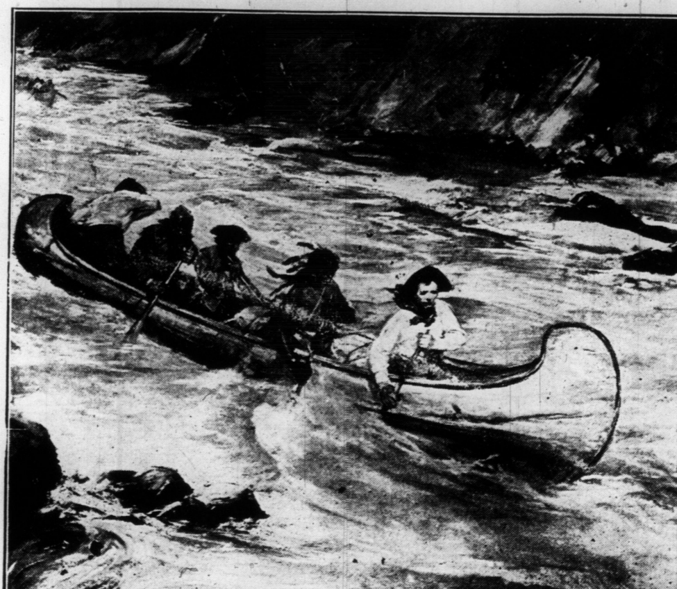
SIMON FRASER, SHOOTING THE RAPIDS OF THE FRASER RIVER, NEAR LETHBRIDGE, ALTA.