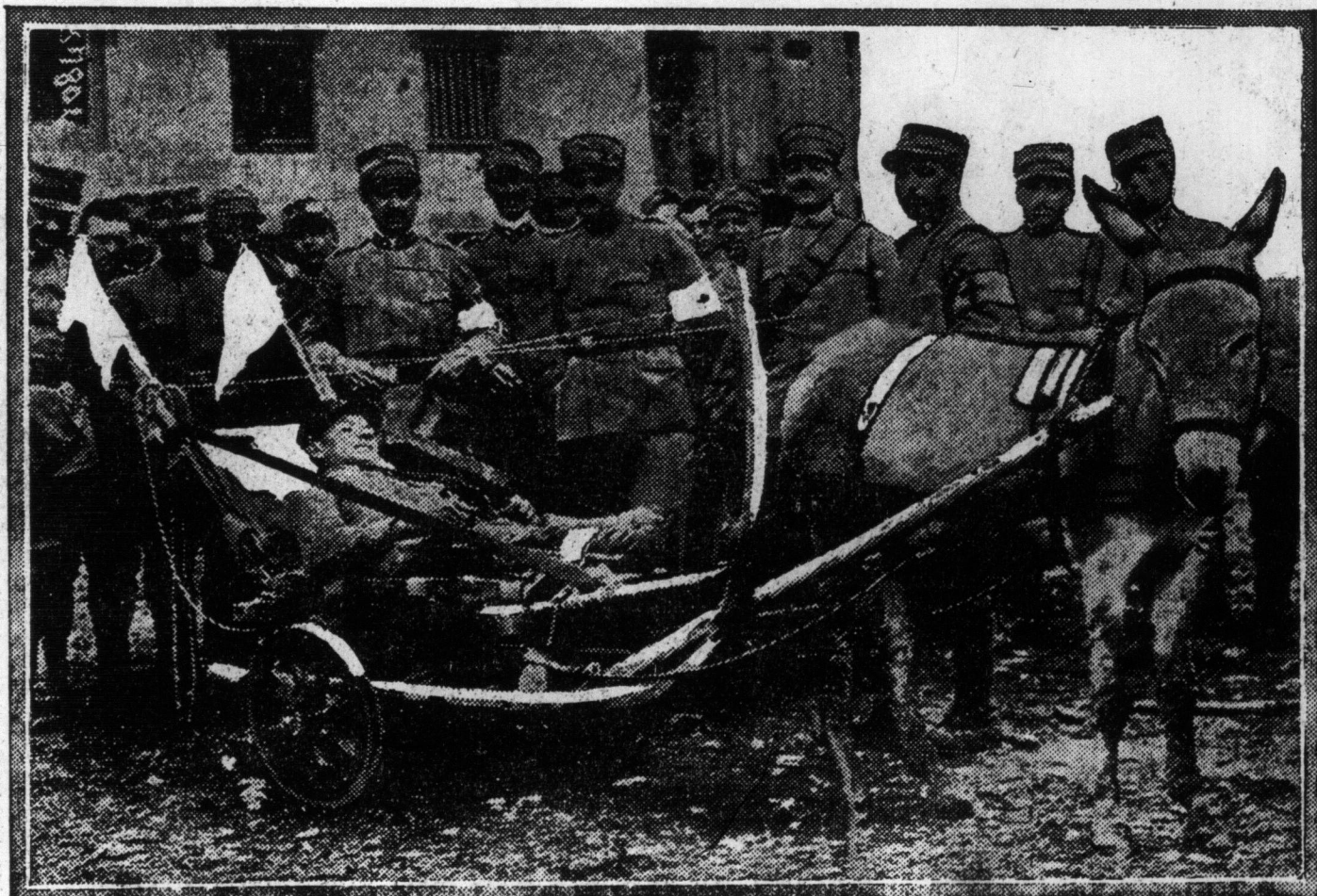
The Italian method of transferring wounded from the mountains. This "rig" can be taken over the roughest roads with comparative comfort to the patient.