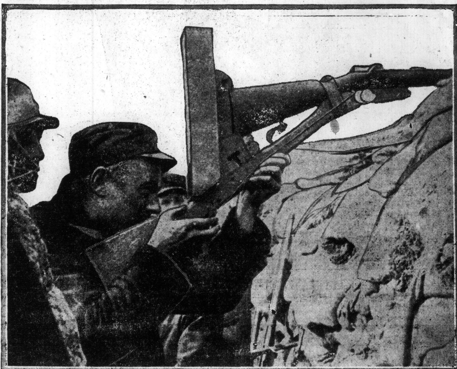
A novel periscope gun constructed by a French soldier in the trenches. It is quite a success and may be further developed to save the soldiers in trench warfare.