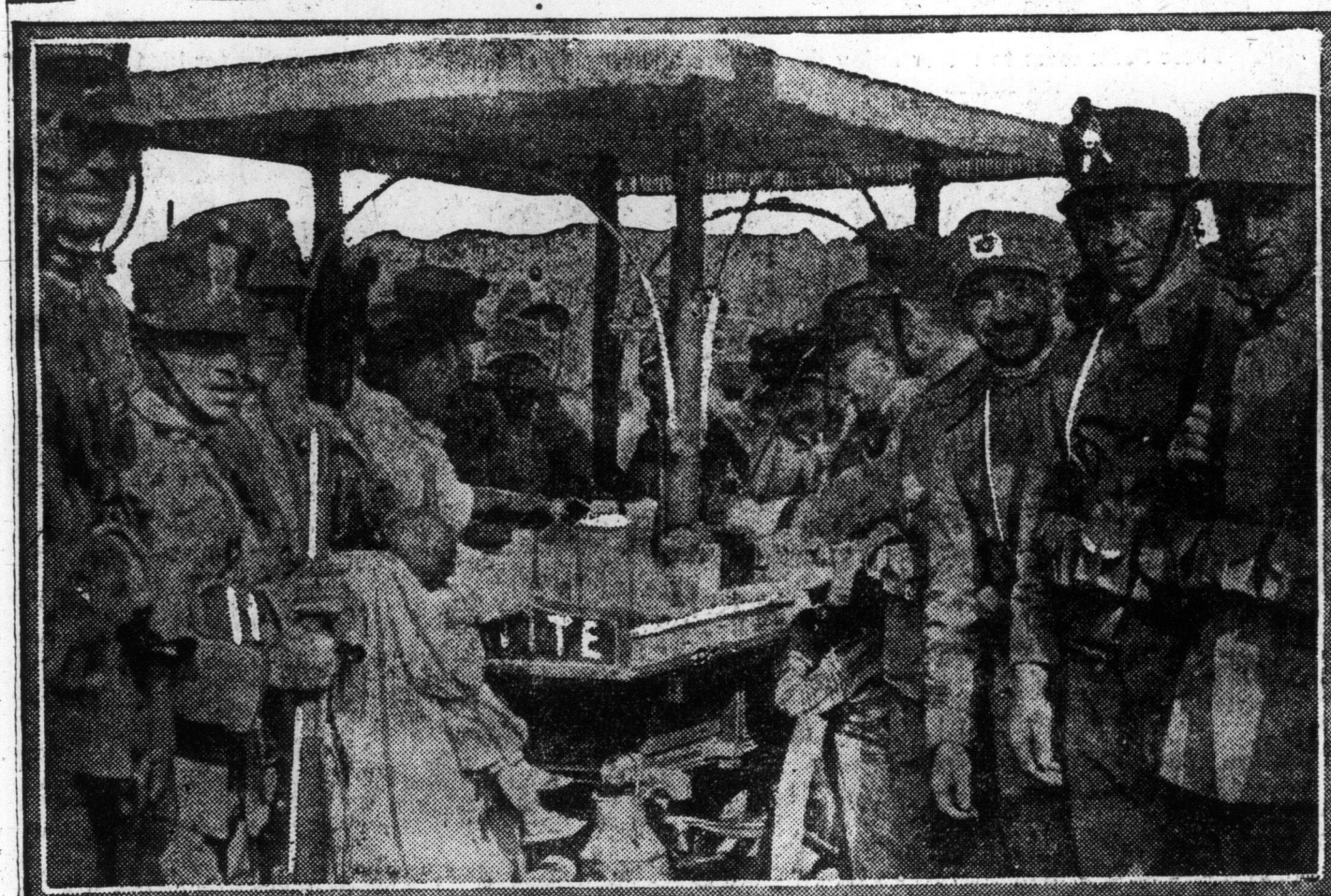
Italian soldiers, about to leave for service in Asia Minor, gathered about an ice-cream vendor. They seem quite happy at the prospect of a chance to get at the Turks once again.