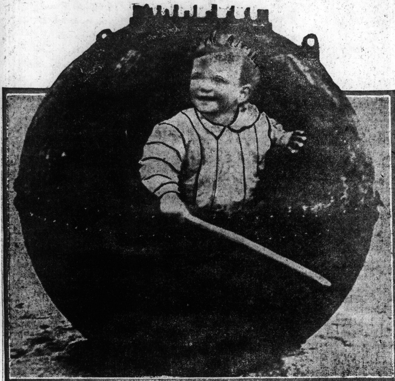
As safe a refuge as he could wish. A young Danish child playing in the shell of an exploded submarine mine washed upon the Danish coast during a storm.