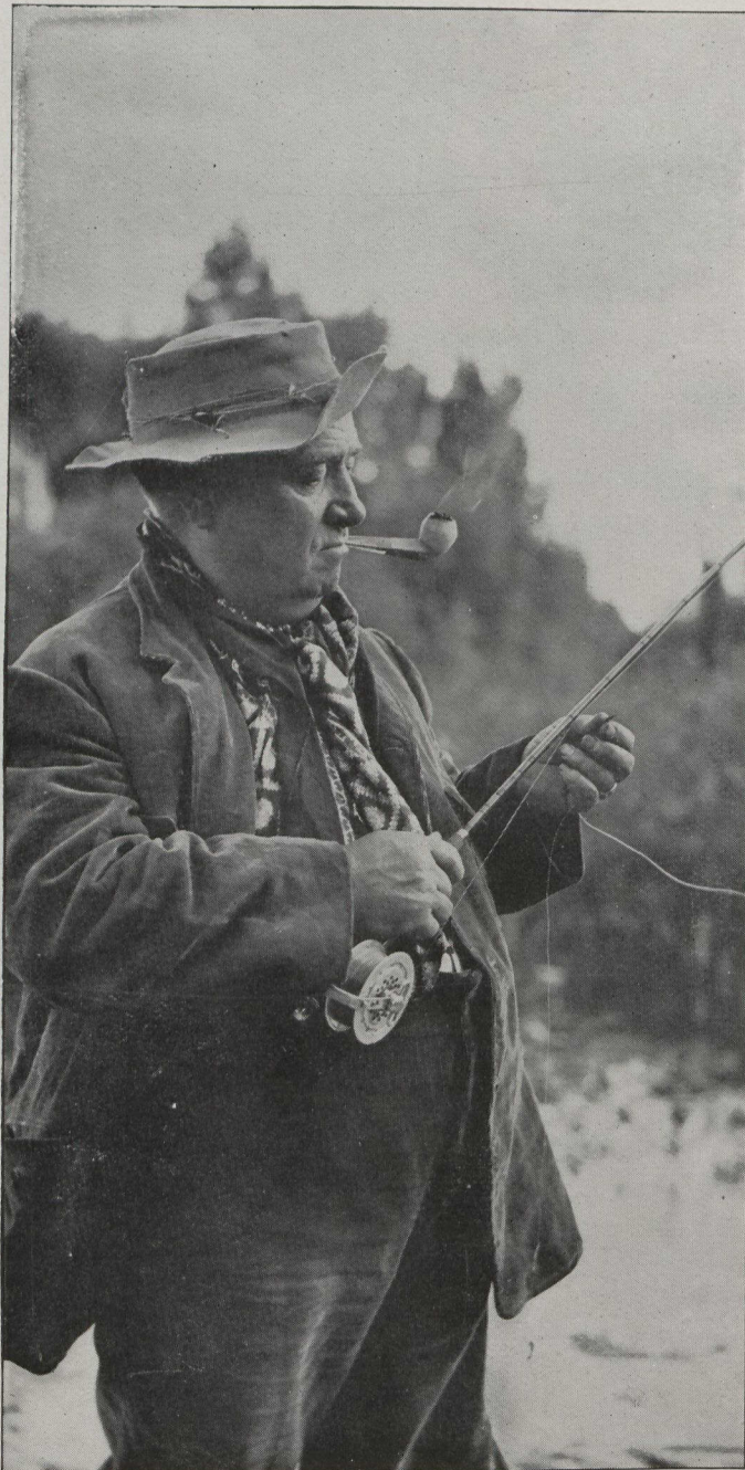
FROM NO. 4A FOLDING KODAK NEGATIVE.