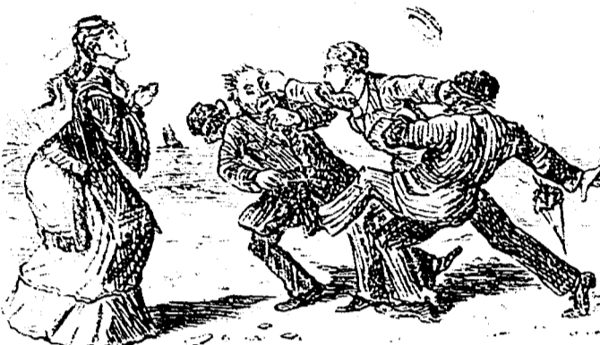
SCENE 4.—GUANT RESCUE.