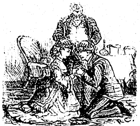
SCENE 6.—INFINITE REWARD.