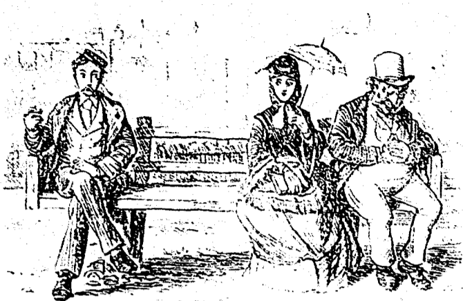
SCENE 1.—THE RENDEZVOUS.