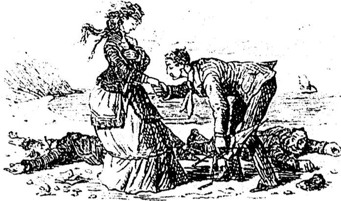
SCENE 5.—RECOVERED AFFECTION.