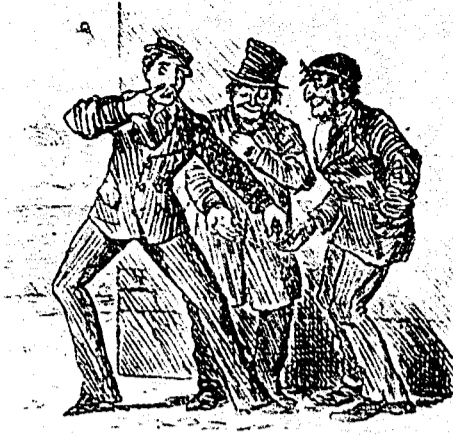
SCENE 2.—THE RISK.