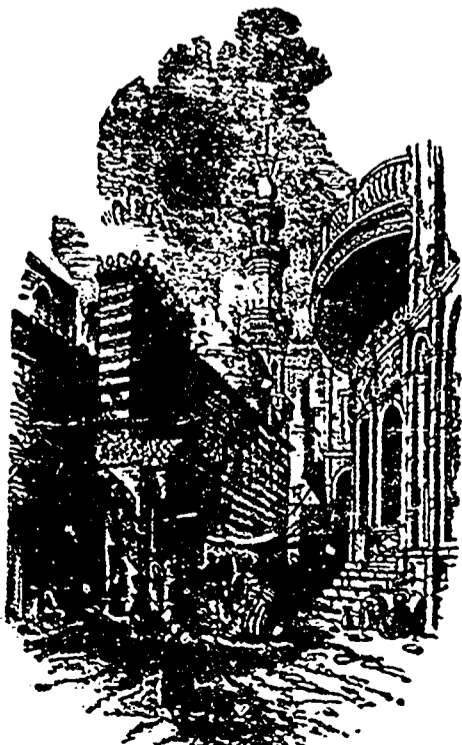
STREET LEADING TO A MOSQUE IN CAIRO.