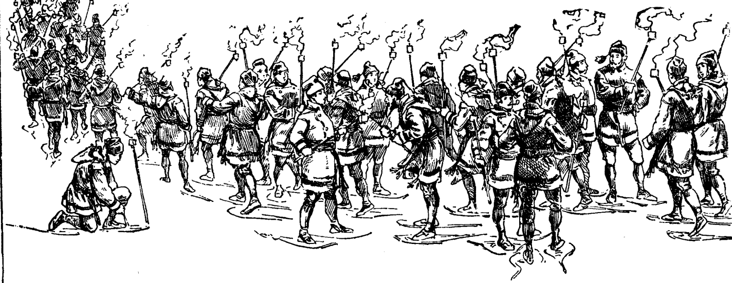
WINTER SPORTS IN CANADA.