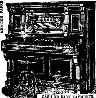
CASH OR EASY PAYMENTS.

and for a complete description of the instrument made by us, see OUR NEW SOLVING CATALOGUE FOR 1900, handsomely illustrated in colors. The most complete in such catalogue in the trade. The frontispiece is a masterly reproduction in facsimile of an interesting oil painting, designed and executed for us by an eminent artist, representing "SAINT CECILIA AND THE ANGELIC CHORUS." This beautiful catalogue is sent CHARGES PREPAID, and we also include our novel reference book, "THE HEART OF THE PEOPLE."