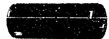
PATENT ROLLER BEARING