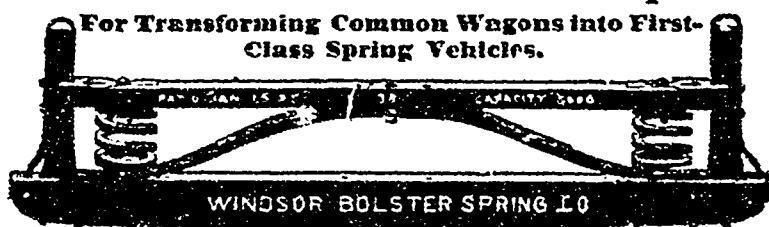
WINDSOR BOLSTER SPRING 10

For Transforming Common Wagons into First-Class Spring Vehicles.