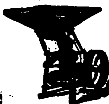
I X L FEED MILLS.

Round or Square. Cap city from 12 to 2,355 barrels.