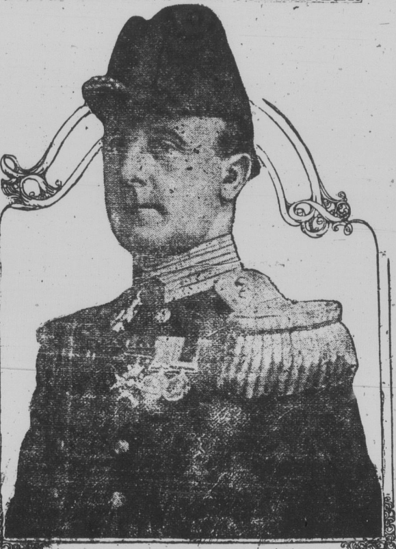
Admiral Jellicoe is commander in chief of the British navy. He will lead Britain's sea fighters against those of the Kaiser.

(Special War Despatch) St. John, Aug. 13th.—Matters in the North Sea are still shroud- ed in mystery and no news of any kind has been issued to the press.