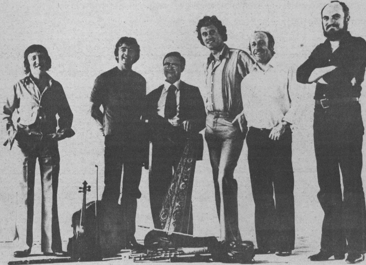
The Chieftains backed up the Pope last summer in Dublin but tomorrow night in SUB they're on their own. However, you better talk to your favorite bootlegger if you want tickets.

(416) 366-7551, ext. 362 Orysia Humenny.