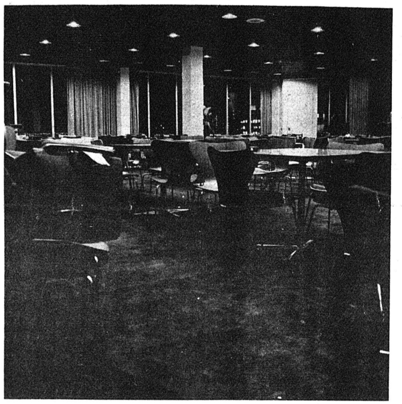
RATT--- sometimes they serve wine and beer