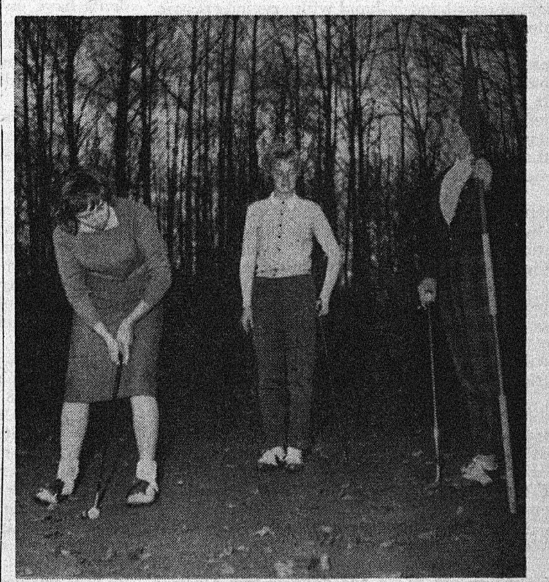
FORE AND ONE-HALF