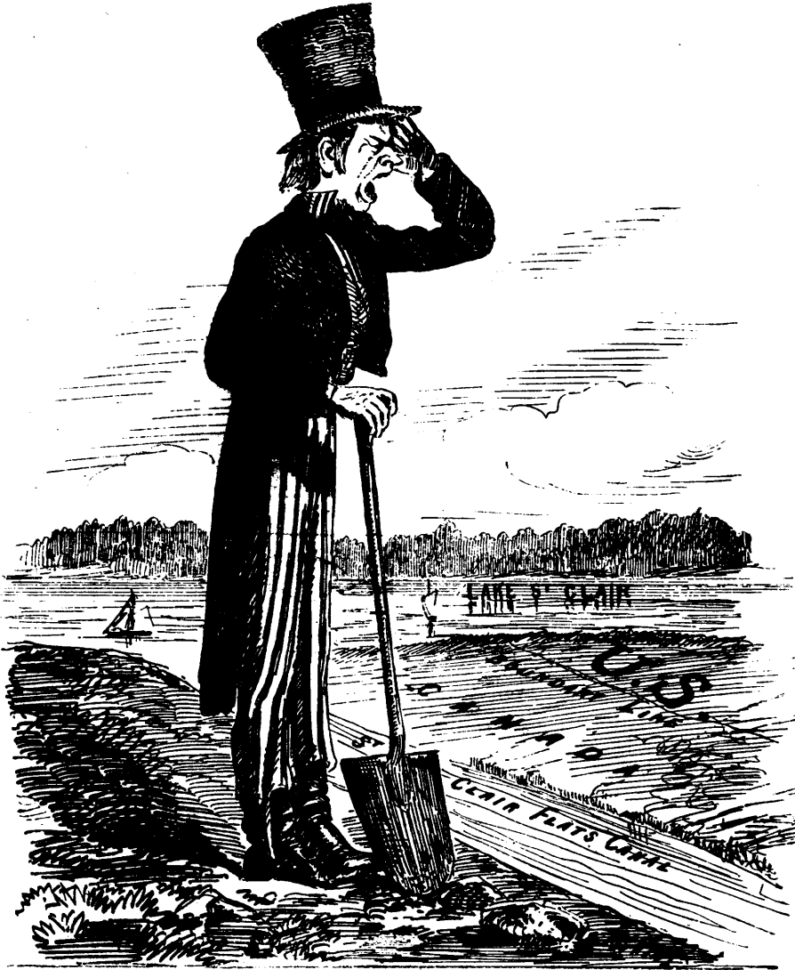
O!-O-OO. HERE I'VE BEEN, AND DUG THAT ERE CANAL RIGHT THROUGH CANADIAN TERRITORY, AND NEVER KNEW IT. Oo-oo-oo. B! O-HOO.