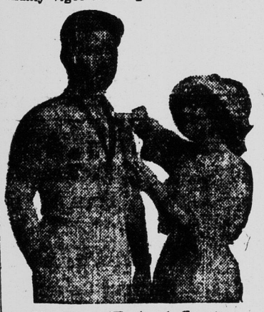
He Wins—Manhood Counts