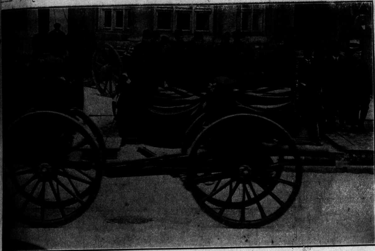
Not a military funeral. Artillery passing the saluting point at which the Duke of Connaught is stationed for the review of overseas forces.