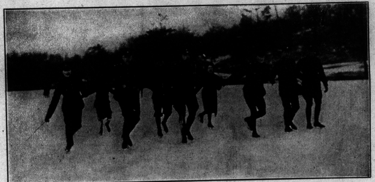
Soldiers on skates. A group of the Empire's defenders at Exhibition Camp enjoying a half-day's leave on the ice.