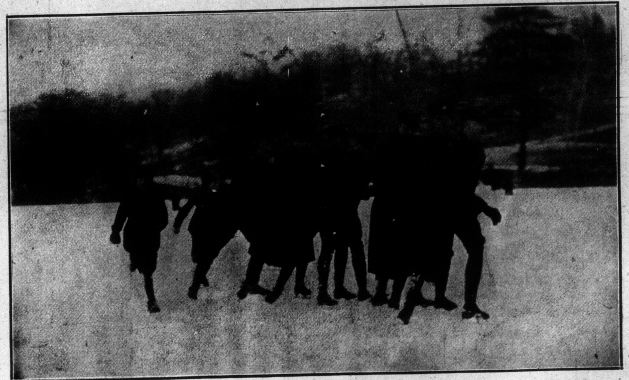
Winter pastimes of the soldiers. A bunch of the boys in khaki enjoying themselves on Grenadier Pond with the ubiquitous small boy at the rear.