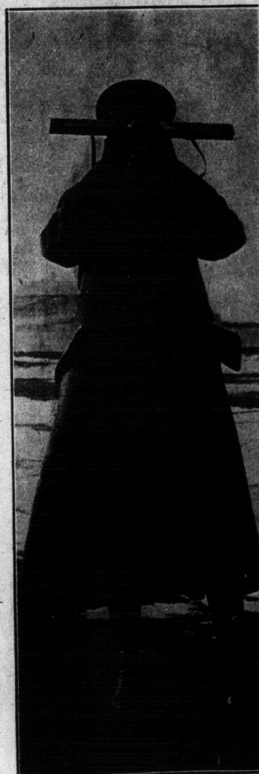
Preparing to locate the kaiser. Officer at Exhibition Camp working a range-finder.