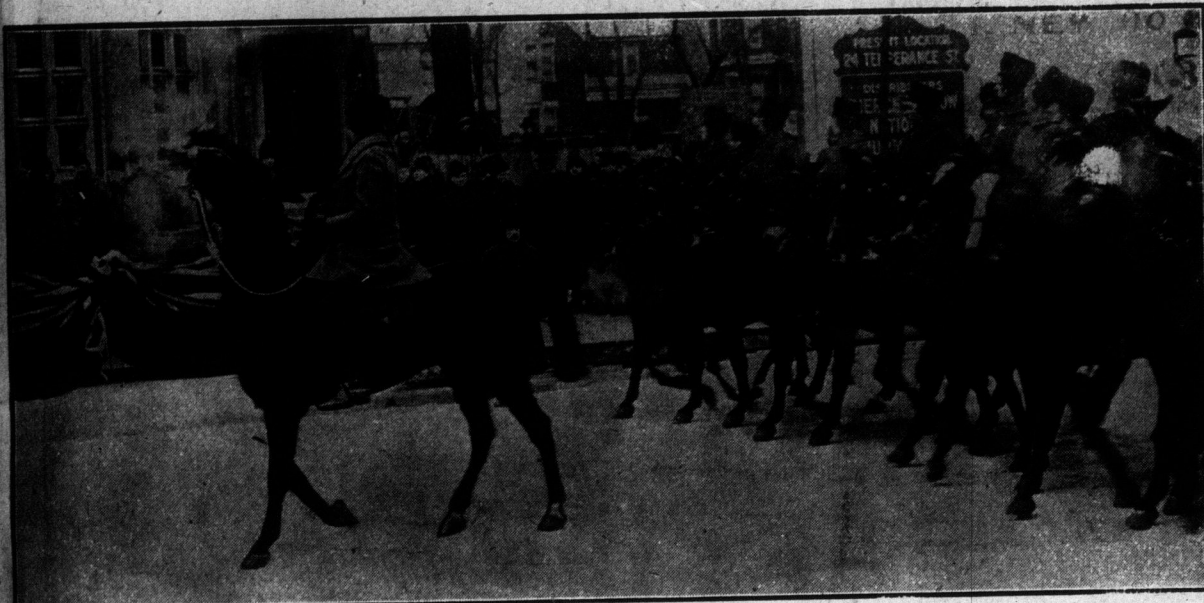
Jack Frost's busy day. The Royal Canadian Dragoons passing the saluting point when the Duke of Connaught reviewed the overseas forces. Note the effect of the frost on the breath of the mounts.