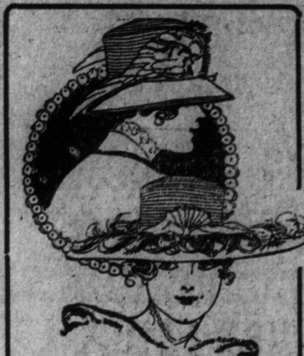
Trimmed Panamas Today at $4.50

Good quality Panamas are used, and are trimmed with white flowers and rich ribbons, or with white ornaments. Some are embroidered in wool. All are new, and no two alike. Special price for today 4.50